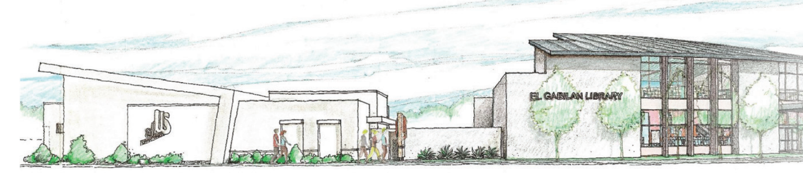
Architects: Anderson Brulé Architects, Inc

While the new library is under construction, The Library Connection@Northridge will offer limited library service to North Salinas residents. New books for children and adults are available for checkout, as well as DVDs, music CDs, and audiobooks.